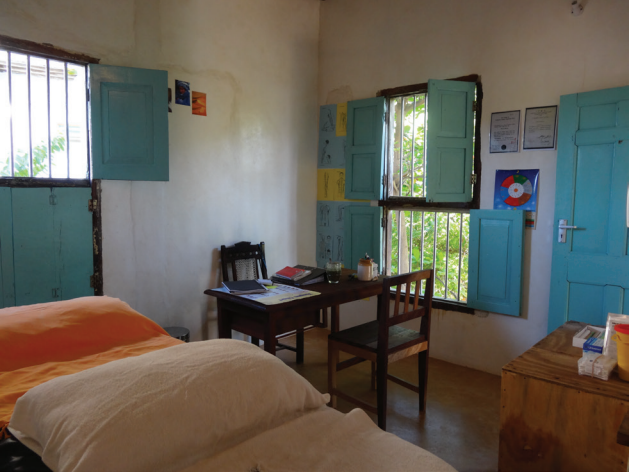
AcuMedic donated medical equipment to clinics in Kenya.